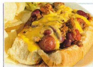
Chili Cheese Dog 7.50

Gilled cheese sandwich on homemade bread. Served with a cup of our homemade creamy tomato soup