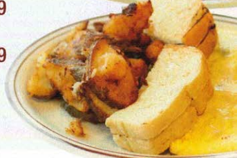
Cheese Omelet w Home Fries