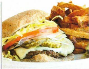
Fresh Ground Cheeseburger ... 10.99

Add lettuce, tomatoes & onions for $1.10