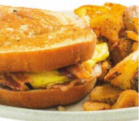
Breakfast Sandwich w Home Fries