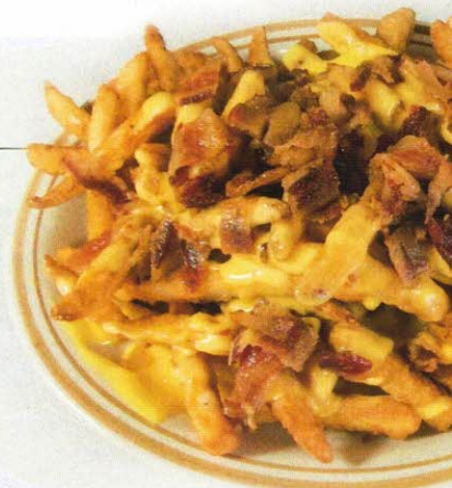
Bacon Cheese Fries