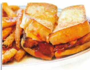
Honey BBQ Chicken Melt. .... 10.99

Fresh garden lettuce, tomato, onion, turkey, ham, provolone, shredded cheddar, 2 eggs, sweet peppers, pickles, croutons