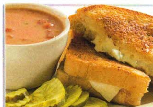
Grilled Cheese & Tomato Soup 7.50

Gilled cheese sandwich on homemade bread. Served with a cup of our homemade creamy tomato soup