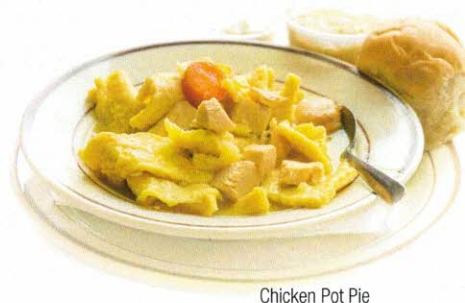
Chicken Pot Pie