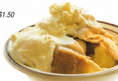
Hot Apple Dumpling with Ice Cream

Add whipped cream or Soft Serve Ice Cream for $1.50