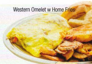
Western Omelet w Home Fries