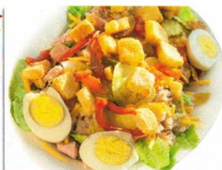
Chef Salad .... 9.99

Turkey, bacon, Swiss cheese & Russian Dressing on grilled homemade bread. Upgrade to French fries for $2.50