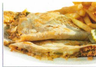
Philly Steak Quesadilla 10.99

Philly chicken steak, bacon, and ranch dressing