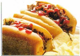
Ribeye Cheese Steak 12.50

Corned beef, sauerkraut, Russian dressing and Swiss cheese grilled on rye. Upgrade to French fries for $2.50