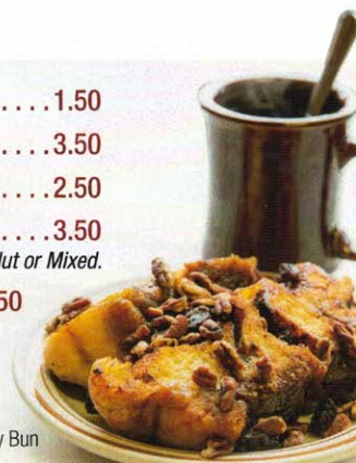
Grilled Sticky Bun