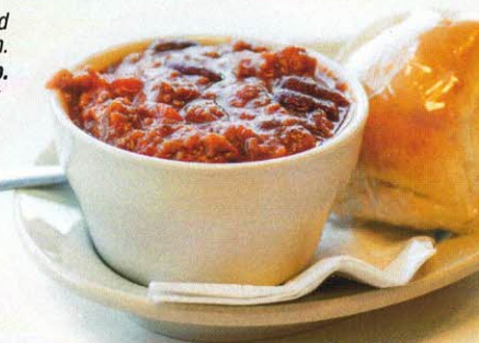
Cup of Chili